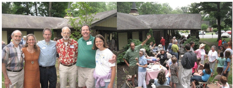
UUCSV's 5th Year Building Anniversary!