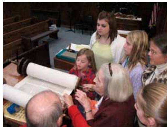
Middle/High School RE class visits Beth Ha Ta Phila synagogue as part of the Neighboring Faiths curriculum this year. They even got to hold and open the Torah!