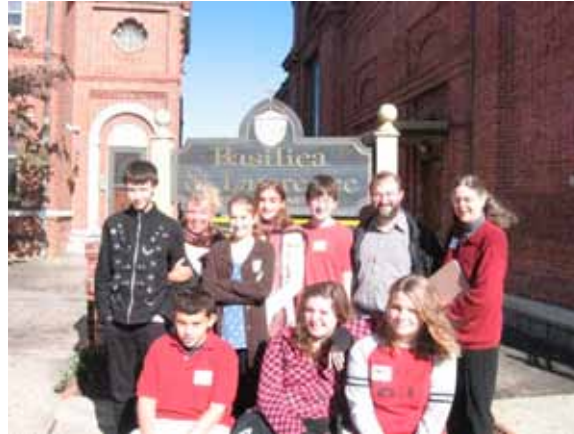
Here on October 26, they toured the Basilica of St. Lawrence in Asheville and attended a Mass and saw a Baptism and Eucharistic Communion.

Since we have such full curriculums for our elementary and middle/high school youth, the RE Committee has decided to extend class time to 12:15 for these two groups. Preschool class will still end at 12 noon. Parents, please pick up your children at these times. This is so children and teachers can finish up projects and processing of the week's lesson. A very light snack will be served in class, but children and youth will join the adults for coffee hour at the end of class time.