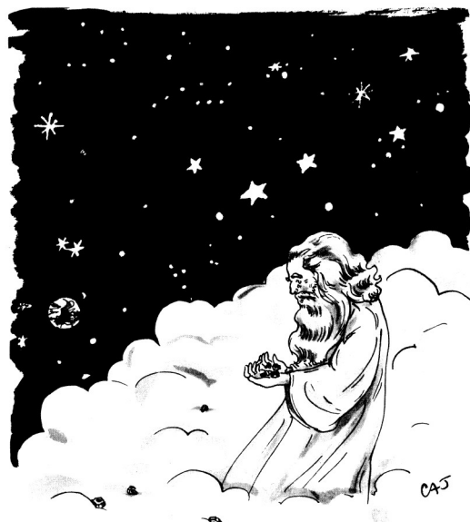
ON THE EIGHTH DAY, GOD FOUND A LOT OF ASSEMBLY PARTS LEFT OVER.